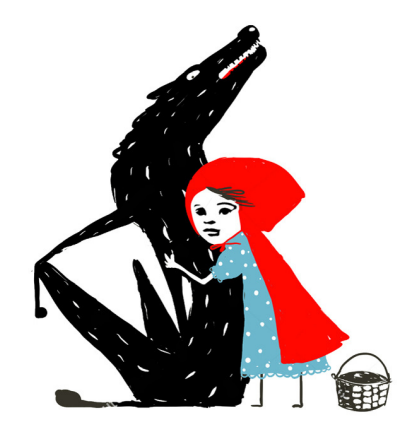
We think there is a happier ending to the story.

Our 2017 Miss Understood has classic Pinot Noir flavors of ripe red cherries and strawberries with hints of herbs and smoke. Its beautiful fruit leads into a long, silky and smooth finish. The strength of our Miss Understood Pinot Noir is that it is so versatile with food, going well with almost anything. Any day of the week! At Mutt Lynch, it is our "red wine with fish" option as well as our choice with more delicate meats like pork loin. Picture marinated pork loin that is grilled on a plank to keep it moist and juicy.