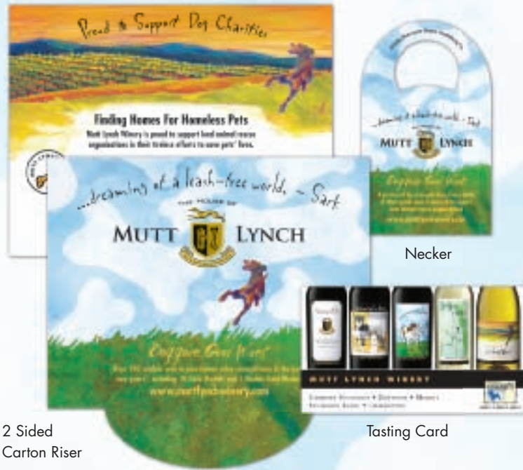
2 Sided Carton Riser