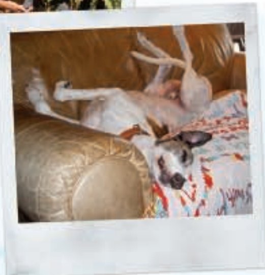
Patch, the winery dog, hard at work.